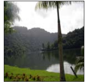
Lago Dos Bocas Tour