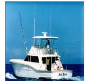
Deep Sea Fishing

Prices include 7% tax • Minimums of 4 to 6 may apply on some of the sightseeing visits. • All admissions are included • Watersports may be considered confirmed and non-refundable up to two-weeks in advance • Land based tours are non-refundable after 9am two days prior to the activity. At this time, services are reserved & guaranteed • While lunch is not included on All Day trips, highly suitable luncheon locations have been selected • The tour schedule may change without prior notice • All timings are approximate and may vary. Traffic and weather conditions may provoke delays that are beyond our control • The cancellation policy for your specific tour will be confirmed upon purchase • Your specific pick up time will be based on your hotel location, and confirmed upon purchase • Tour pricing is based on departures from hotels in the San Juan metropolitan area. Please ask regarding price and availability for pick-ups outside of San Juan.